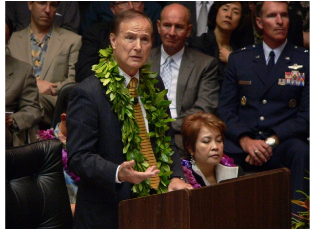
Minority Leader's Opening Day speech