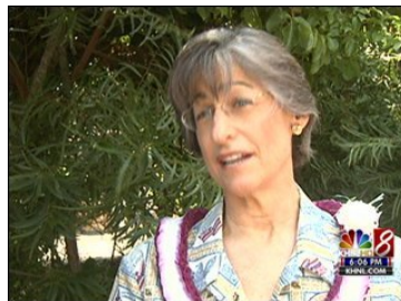
Governor Linda Lingle