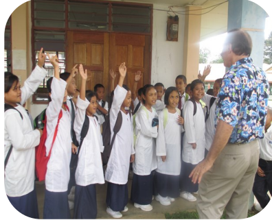
Who wants to go to college?

Recent data suggests that young adults in Hawaii need to be more aggressive in pursuing higher education. We are currently ranked 14th in the world of 25-34 year olds with college level degrees and losing ground when compared to places like Korea and Japan. During the peak of the Great Recession in 2008, only 65% of 23 & 24 year olds with a high school diploma were employed, as compared to 88% of those with college degrees in the same age group. More than being able to get a job, the benefits of higher education go way beyond economics. We can be a stronger nation through higher education and attaining a college education helps address social inequities and improves society. Unless more young Americans embrace the college track, more political and economic decline is likely. As Rep Ward likes to say, "Education is the great equalizer in America".