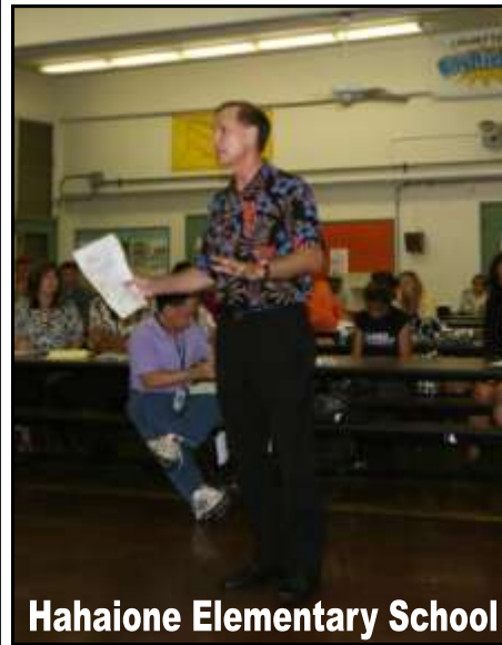
Hahaione Elementary School

A list of doable no-cost or low-cost suggestions such as more signs on buoys regarding boat speed limits, enlarging no-wake areas and re-zoning certain areas